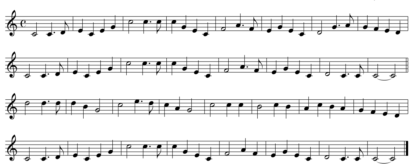
The Happy Wanderer 2/15b