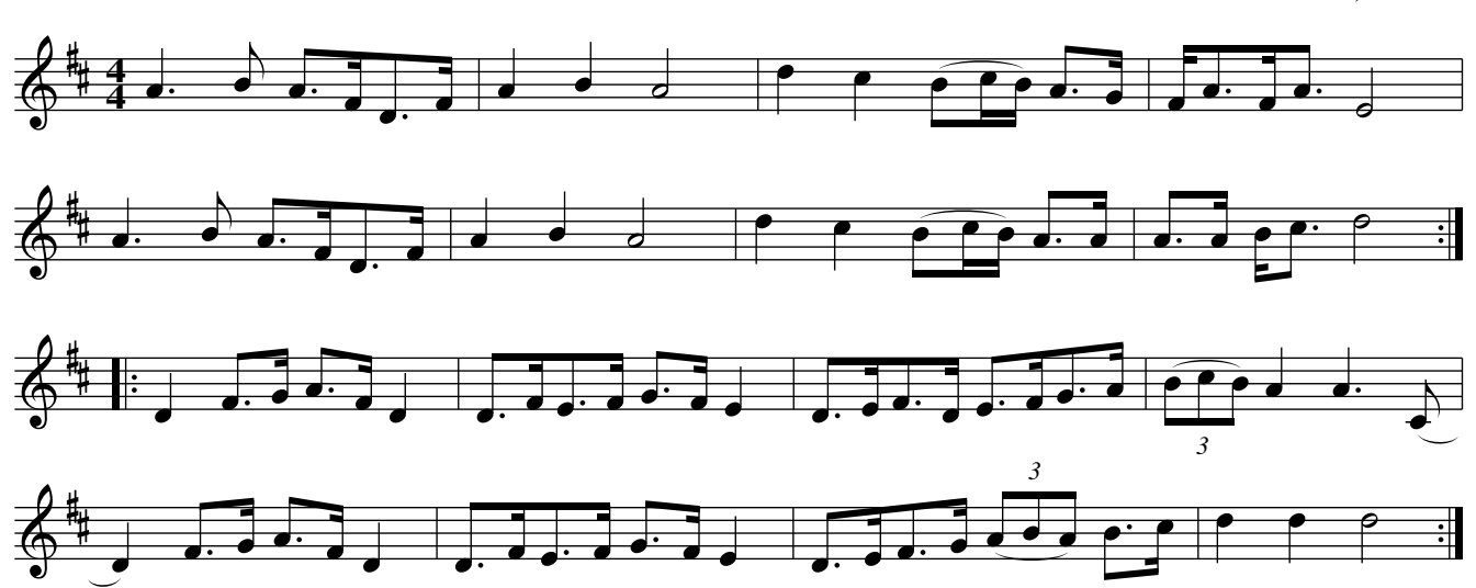
Original in Cmaj, transposed to Dmaj.