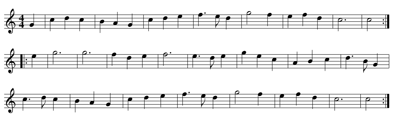
Polka 1/6 No2 Stepdance