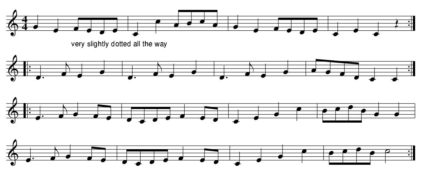
The 17th of March 1/10 St.Patrick's Day