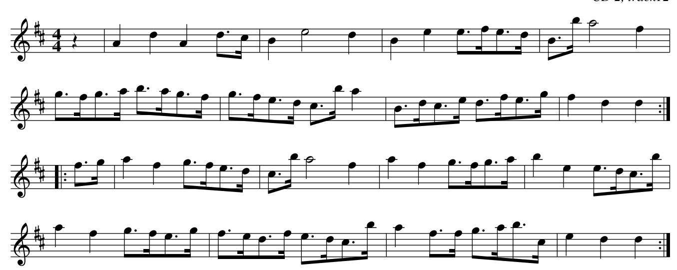
Original key Bbmaj, transposed to Dmaj