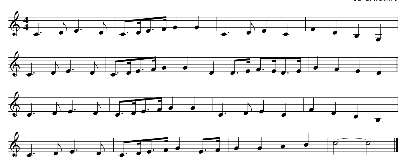
Brook St. Schottische in C 2/8